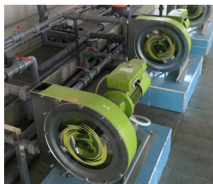
ALP30N lime dosing