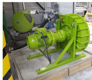
ALHX80 for filter press feeding