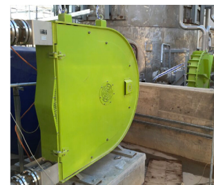
ALX150 and ALH125 for chemical dosing, mining process