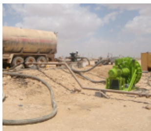
ALH125 crude oil pumping